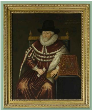
Left: Sir Thomas Egerton